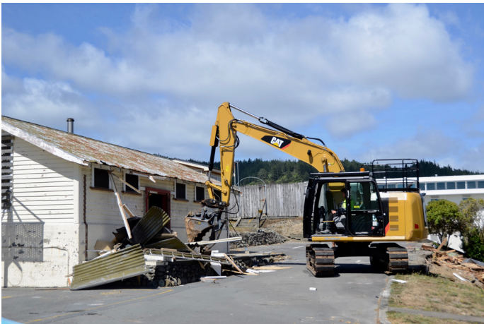
The original swimming pool changing sheds being dealt to .