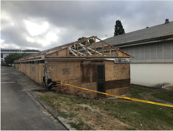
The original building was used as a weight training facilities during the 1980's and before as a class room. It must of been refurbished in the 1960's as the cladding had the original car casing plywood from Jacobson demolitions that recycled the General motors cases