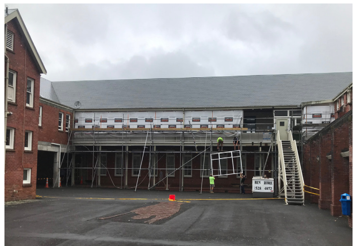
The original wooden framed windows along the balcony Of Dowling block have all been replaced by doubled glazed aluminium. This replacement was carried out by the College's plant maintenance staff lead by Trevor Bushby