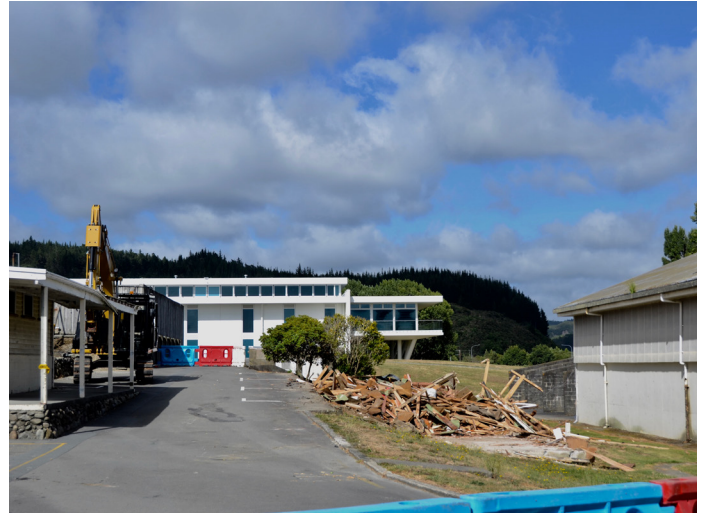
The building was demolished to match wood within minutes after being taken too by the digger