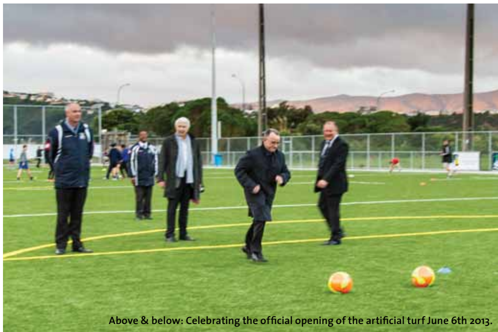
Above & below: Celebrating the official opening of the artificial turf June 6th 2013.

It is now four years since the St Patrick's College Foundation was launched and what a hectic and successful period it has been.