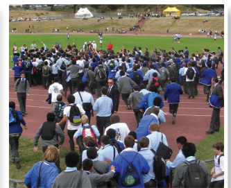
A SEA OF BLUE EMBRACING YARRIDE AT THE FINISH LINE